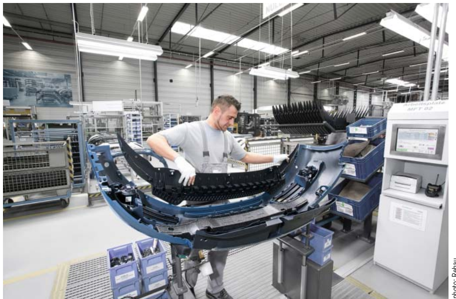
Creative development to the customer's benefit: Rehau develops polymer-based solutions in the areas of construction, automotive, and industry.

Consist to be able to learn new subjects quickly. We've developed a special methodology specifically for this purpose and place particular emphasis on this point when selecting and training our staff. Moreover, at the start of every Managed Services project, we hold an evaluation workshop with the customer. Here, our experts get to know customer-specific requirements and can suggest the ideal setup.